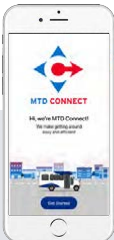
On-demand flexibility, right from your phone.