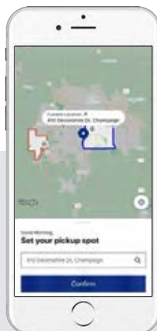
Set a pickup spot and tell us where you're going.